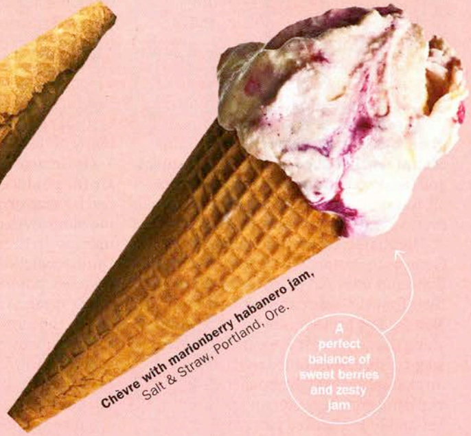
Chèvre with marionberry habanero jam. Salt & Straw, Portland, Ore.

A perfect balance of sweet berries and zesty jam