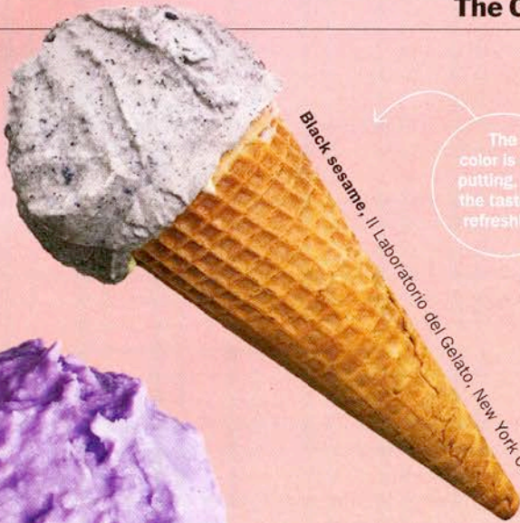
Black sesame. Il Laboratorio del Gelato, New York City

The color is off-putting, but the taste is refreshing